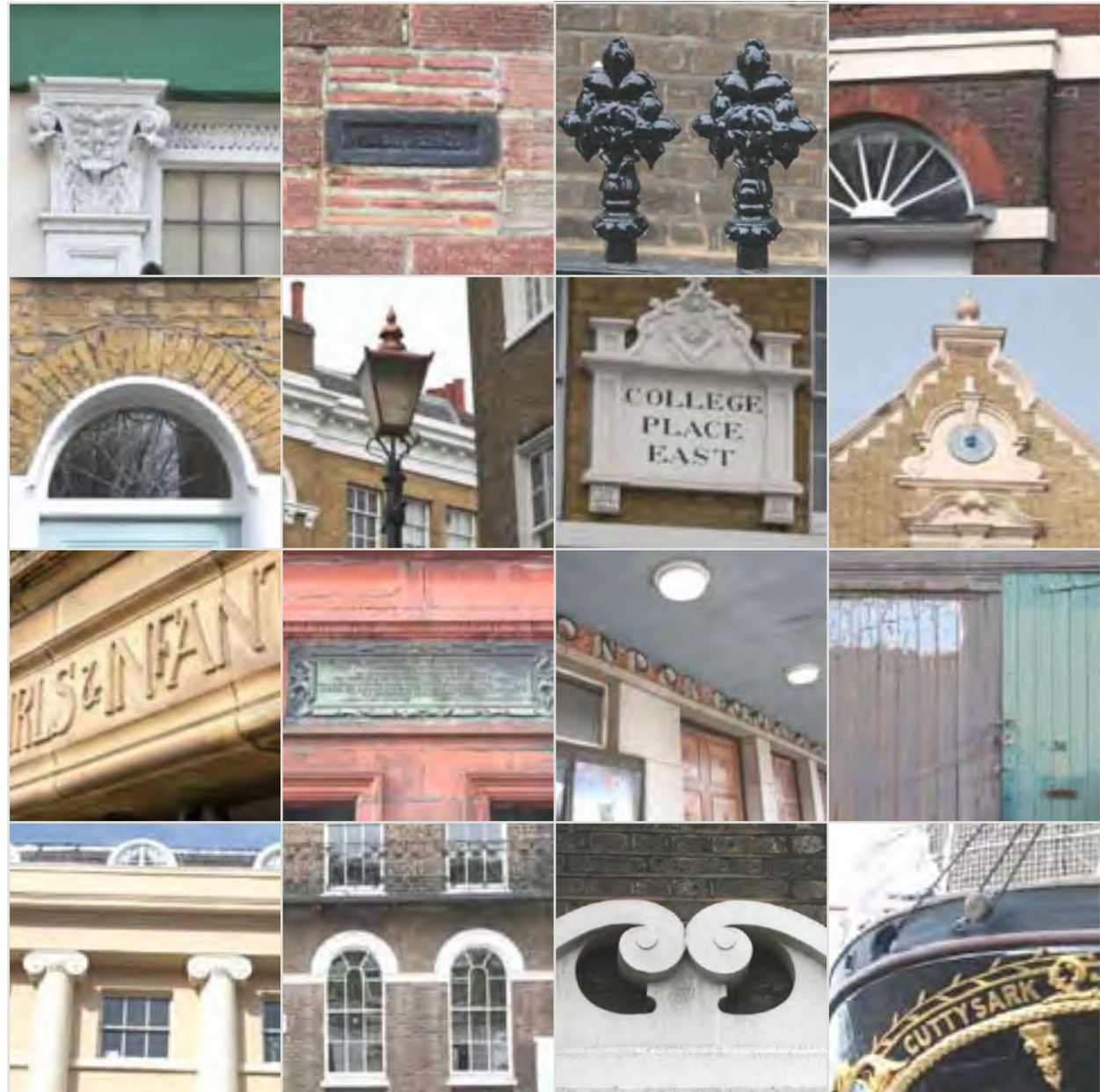
West Greenwich: Local details

This large conservation area embraces a wide range of activities, including offices, education, leisure, shopping and transport. Residential is the main land use, complemented by open space at Blackheath and the Point.