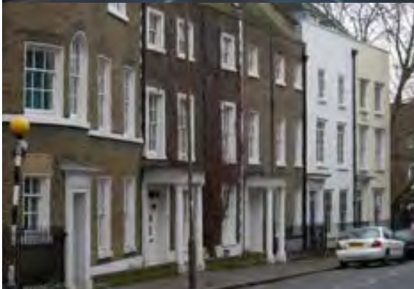
Top: Queen Elizabeth's Cottages Middle: Nelson Road Bottom: Crooms Hill