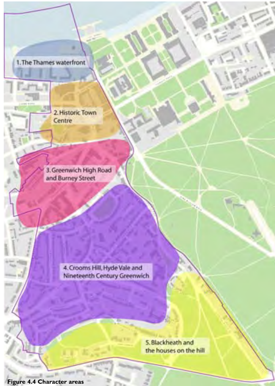
Figure 4.4 Character areas

Reproduced from Ordnance Survey mapping with the sanction of Her Majesty's Stationary Office, Crown Copyright. Unauthorised reproduction may lead to prosecution or civil proceedings. Greenwich Council LA100019695.