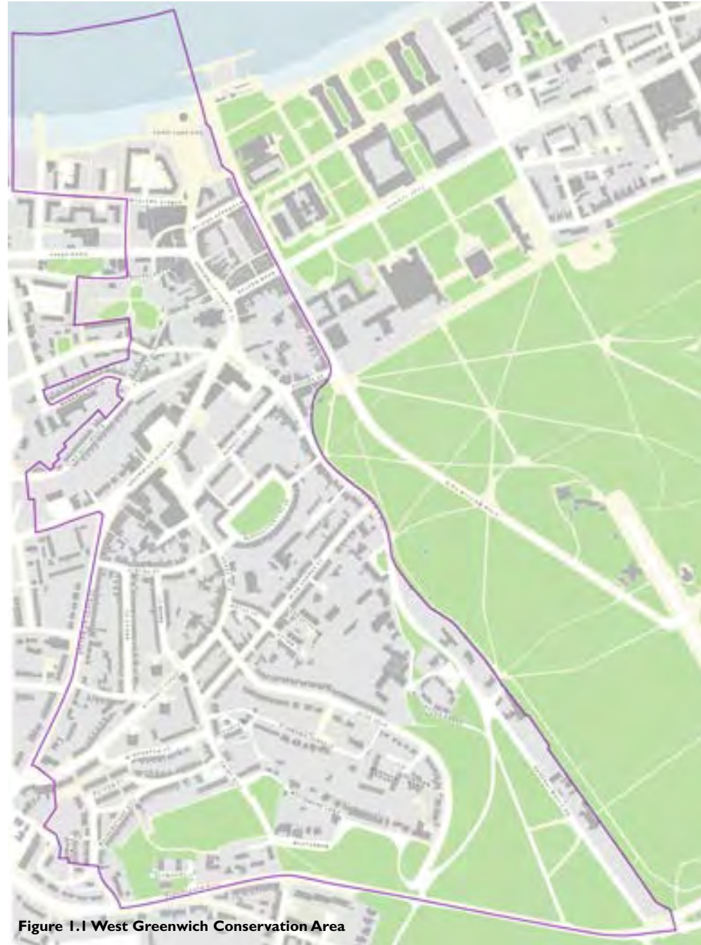
Figure 1.1 West Greenwich Conservation Area

Reproduced from Ordnance Survey mapping with the sanction of Her Majesty's Stationary Office, Crown Copyright. Unauthorised reproduction may lead to prosecution or civil proceedings. Greenwich Council LA100019695.