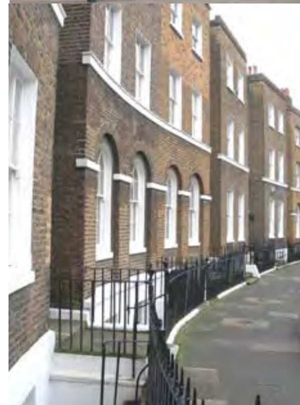
Top: Greenwich railway station Bottom: Gloucester Circus