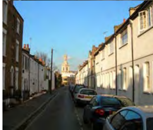
Top left: City of London from Greenwich waterfront Top right: Greenwich Park, from King William Walk Bottom left: Tower of St Alfege, from Straightsmouth