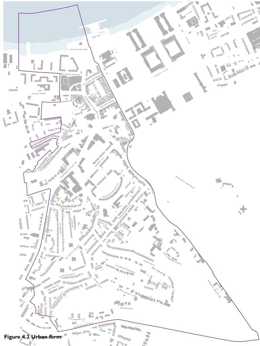
Figure 4.2 Urban form

Reproduced from Ordnance Survey mapping with the sanction of Her Majesty's Stationary Office, Crown Copyright. Unauthorised reproduction may lead to prosecution or civil proceedings. Greenwich Council LA100019695.