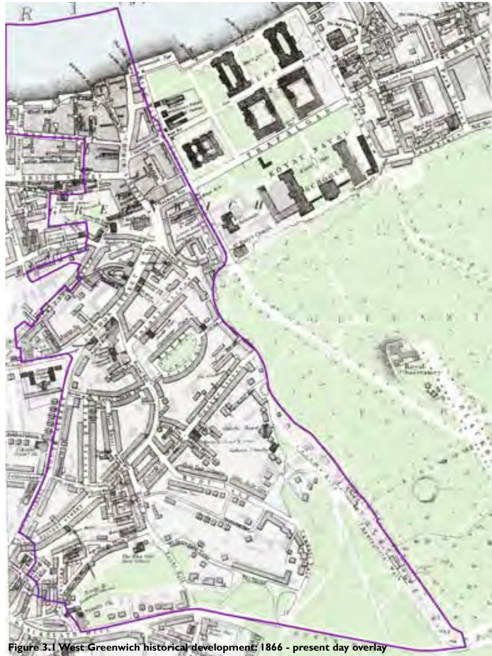
Figure 3.1 West Greenwich historical development: 1866 - present day overlay

In 1999 the Docklands Light Railway was extended to Lewisham with new stations opened at Cutty Sark and Greenwich mainline station. Greenwich University and the Trinity College of Music moved into the Old Royal Naval College and the whole area was opened up to the public.