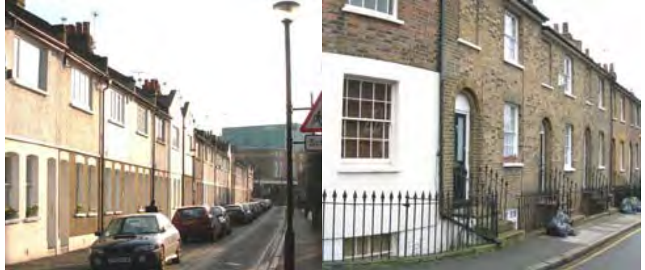
Top left: Hyde Vale Top right: Greenwich Community College Bottom left: Straightsmouth Bottom right: Maidenstone Hill