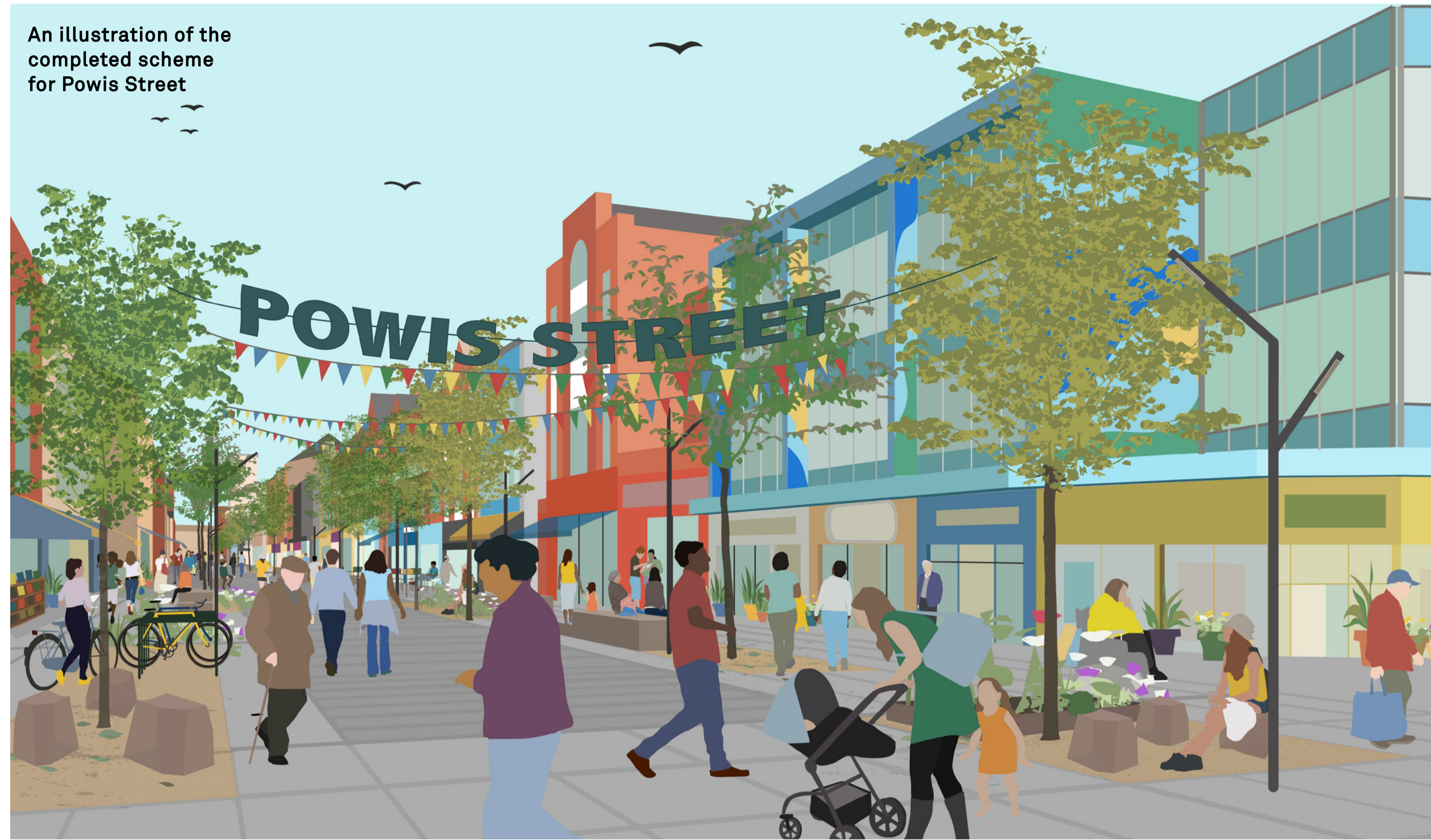
An illustration of the completed scheme for Powis Street