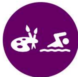
Things to do